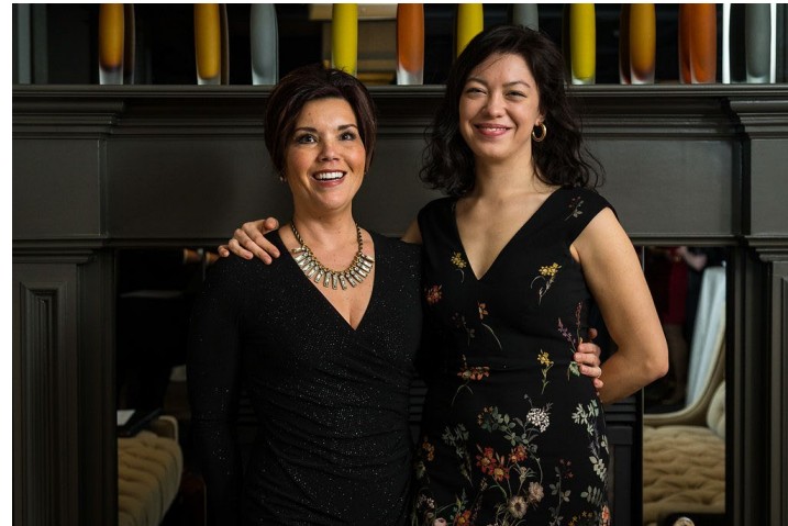
Individual Giving & Membership Programs