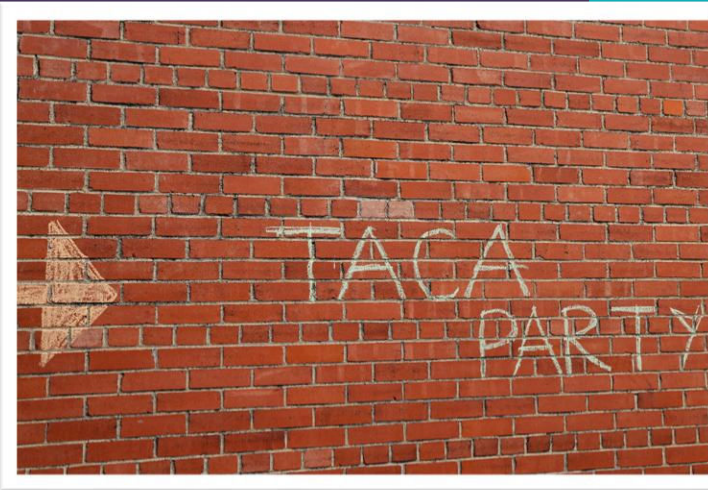
Individual Giving & Membership Programs