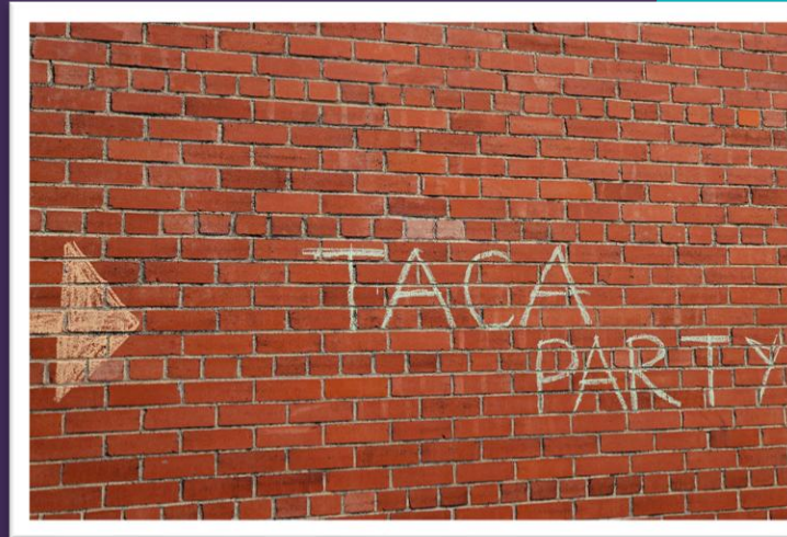
Individual Giving & Membership Programs