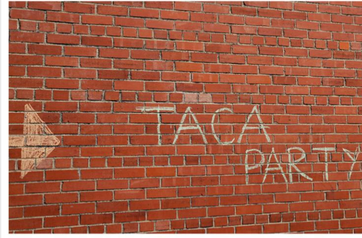
Individual Giving & Membership Programs