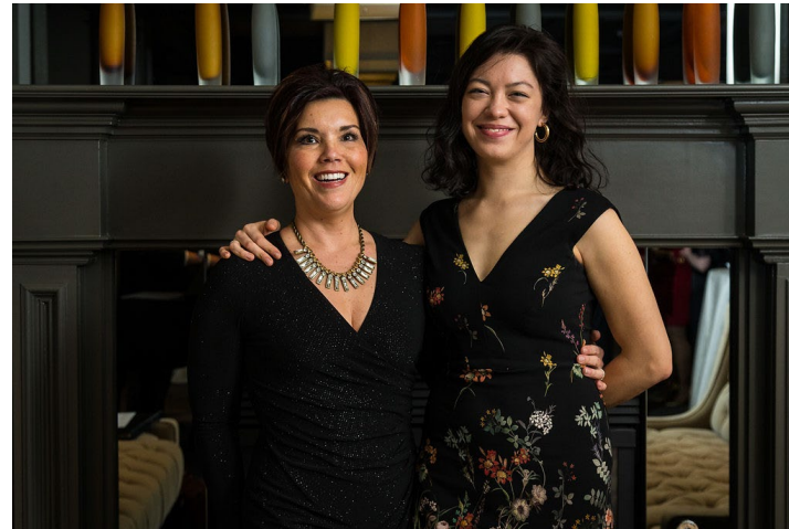
Individual Giving & Membership Programs