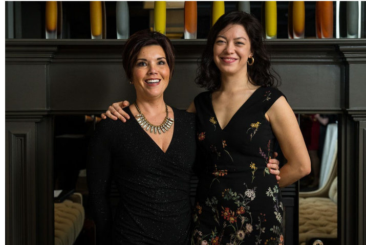
Individual Giving & Membership Programs