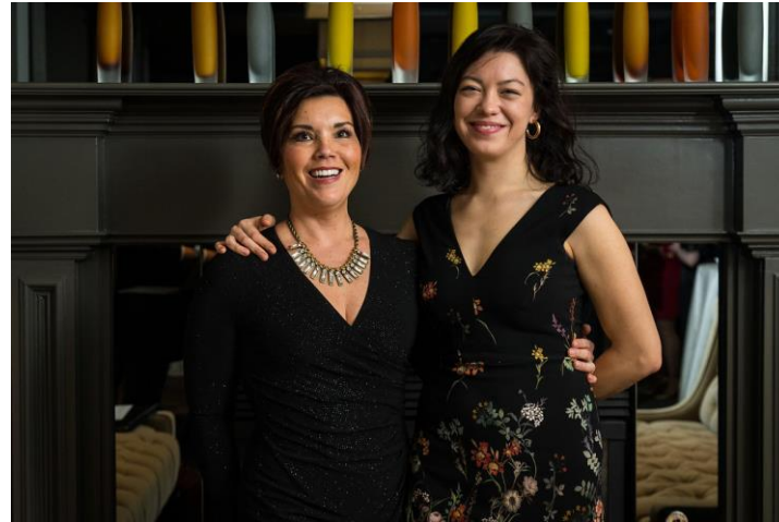
Individual Giving & Membership Programs